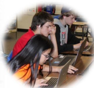
JH students successfully piloted 1:1 Chromebooks last year.

Last year we piloted 1:1 Chromebooks with our junior high students and were encouraged by the program's success as students and staff learned the new Google Platform.